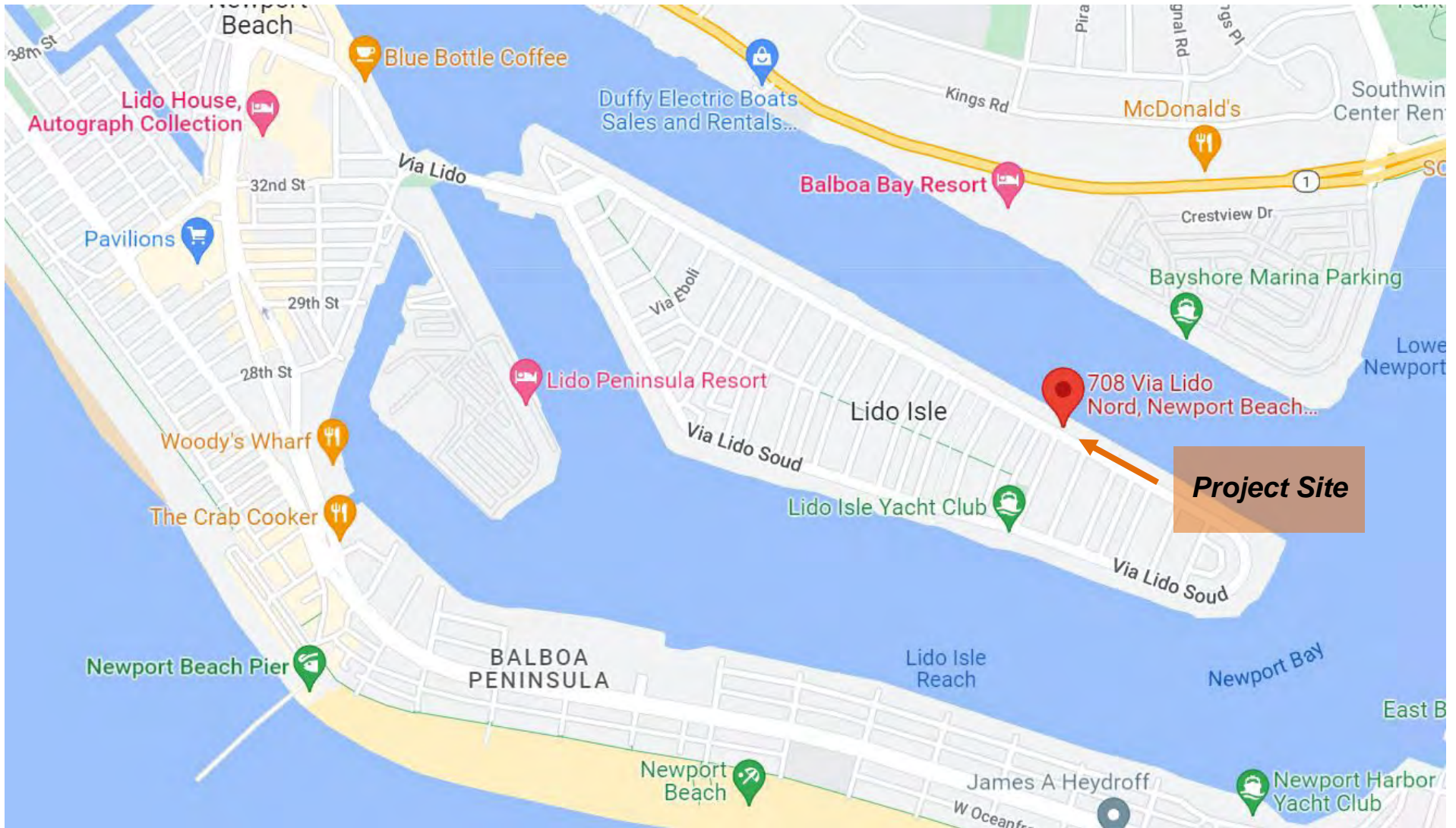
Exhibit No. 1 – Location Map