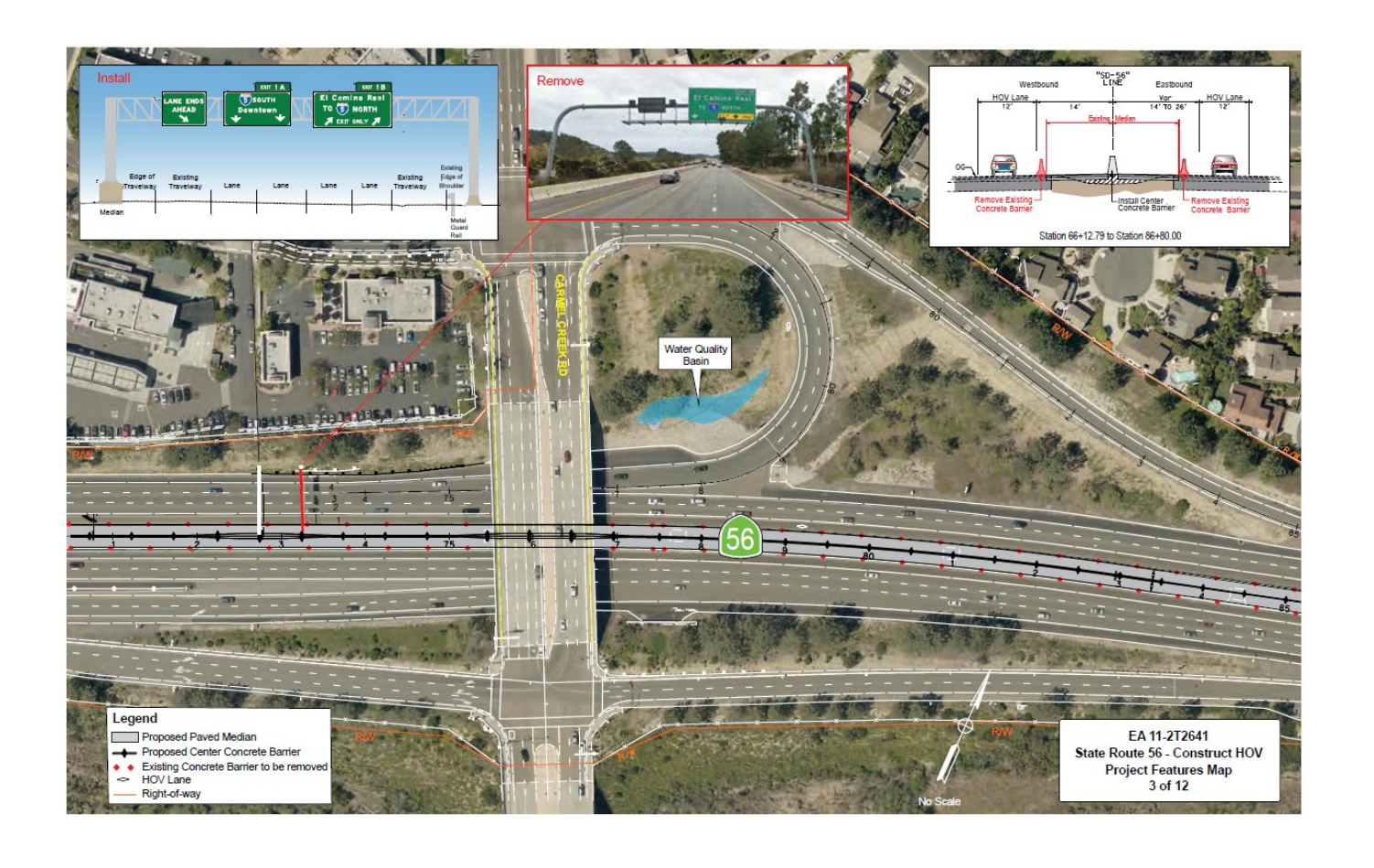
EXHIBIT NO. 4 APPLICATION NO. CDP 6-98-127-A3 Project Features Map California Coastal Commission