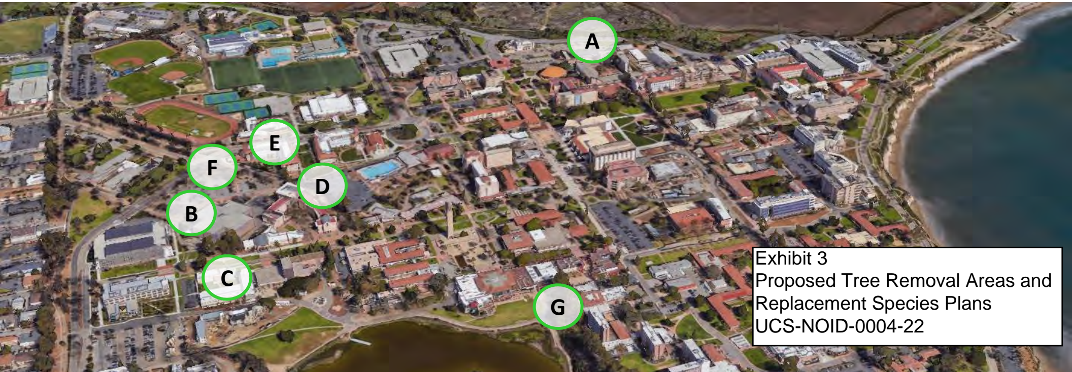
Exhibit 3 Proposed Tree Removal Areas and Replacement Species Plans UCS-NOID-0004-22

*Location G is located adjacent to environmentally-sensitive habitat area buffer, replacement ratio of 3:1