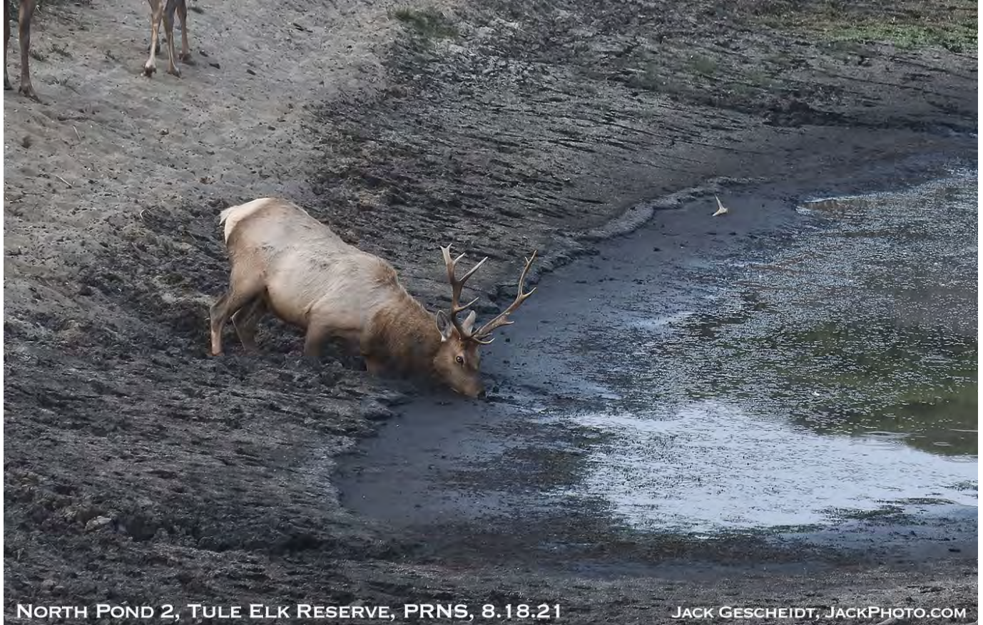
NORTH POND 2, TULE ELK RESERVE, PRNS, 8.18.21

Pat Huey 1443-B Page Street San Francisco, CA 94117