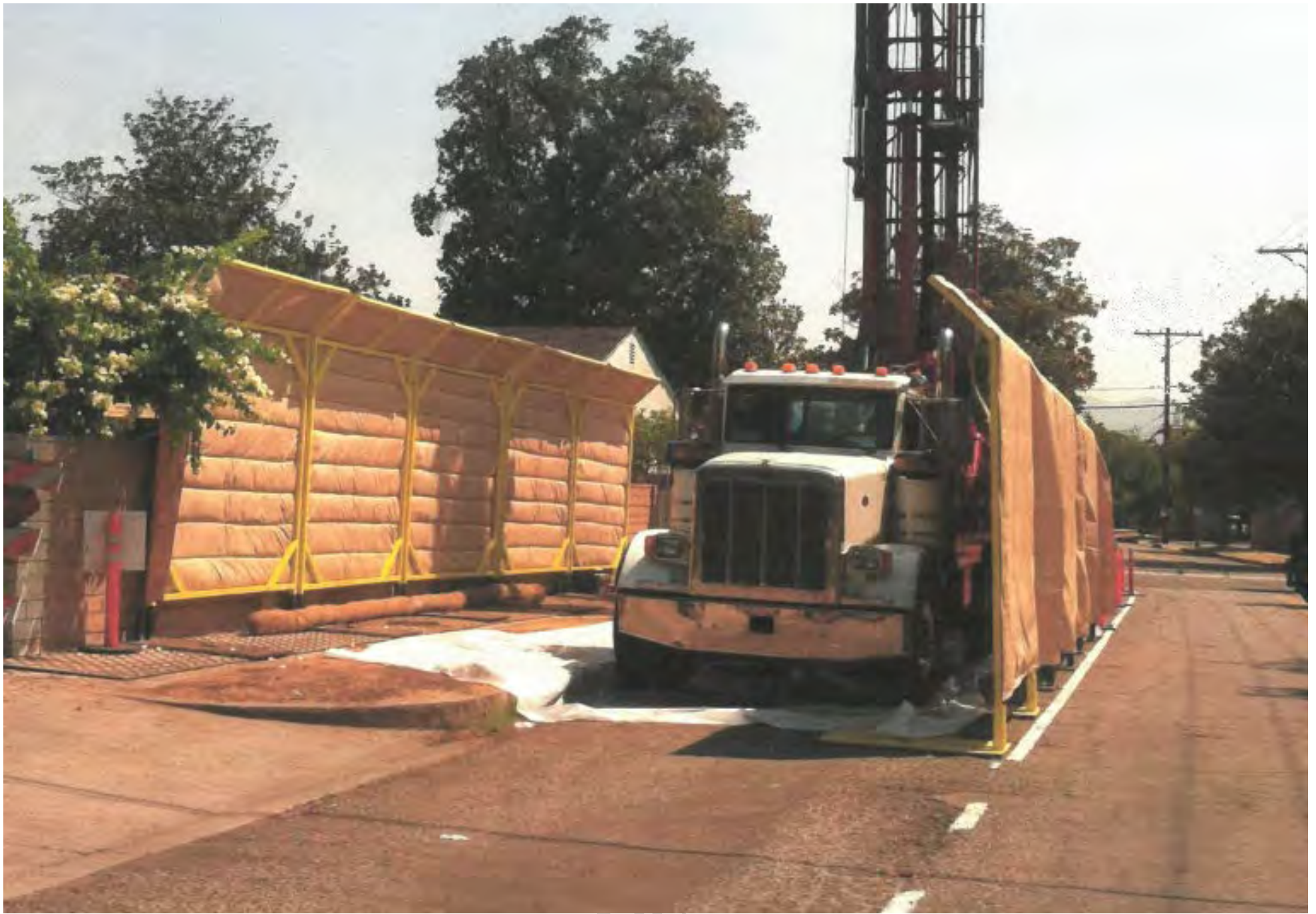
EXHIBIT 3 - Illustration of Noise Barriers CDP 9-23-0785