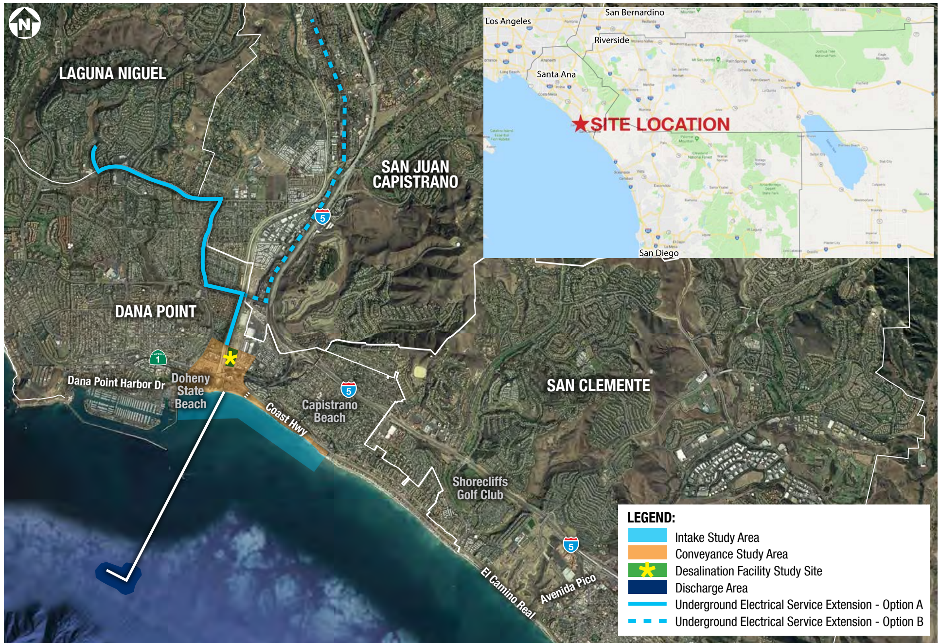
EXHIBIT 1 - Project Location CDP 9-23-0785