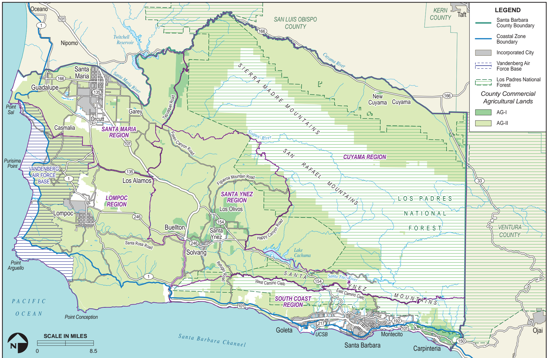
Santa Barbara County Agricultural Resources