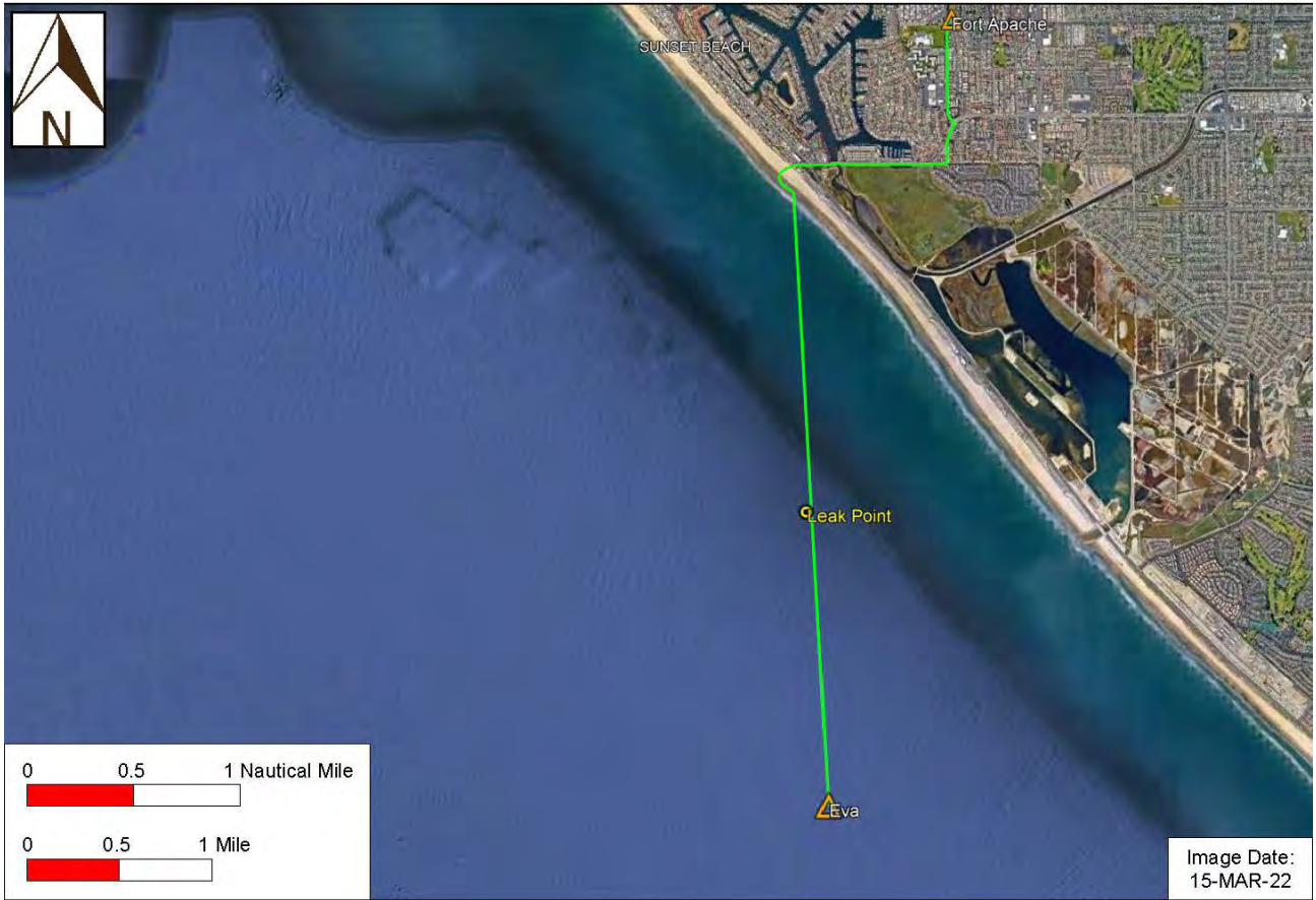
Exhibit 1 9-22-0219