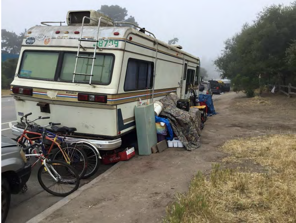
Items piled under OV (Delaware Ave., June 23, 2022)