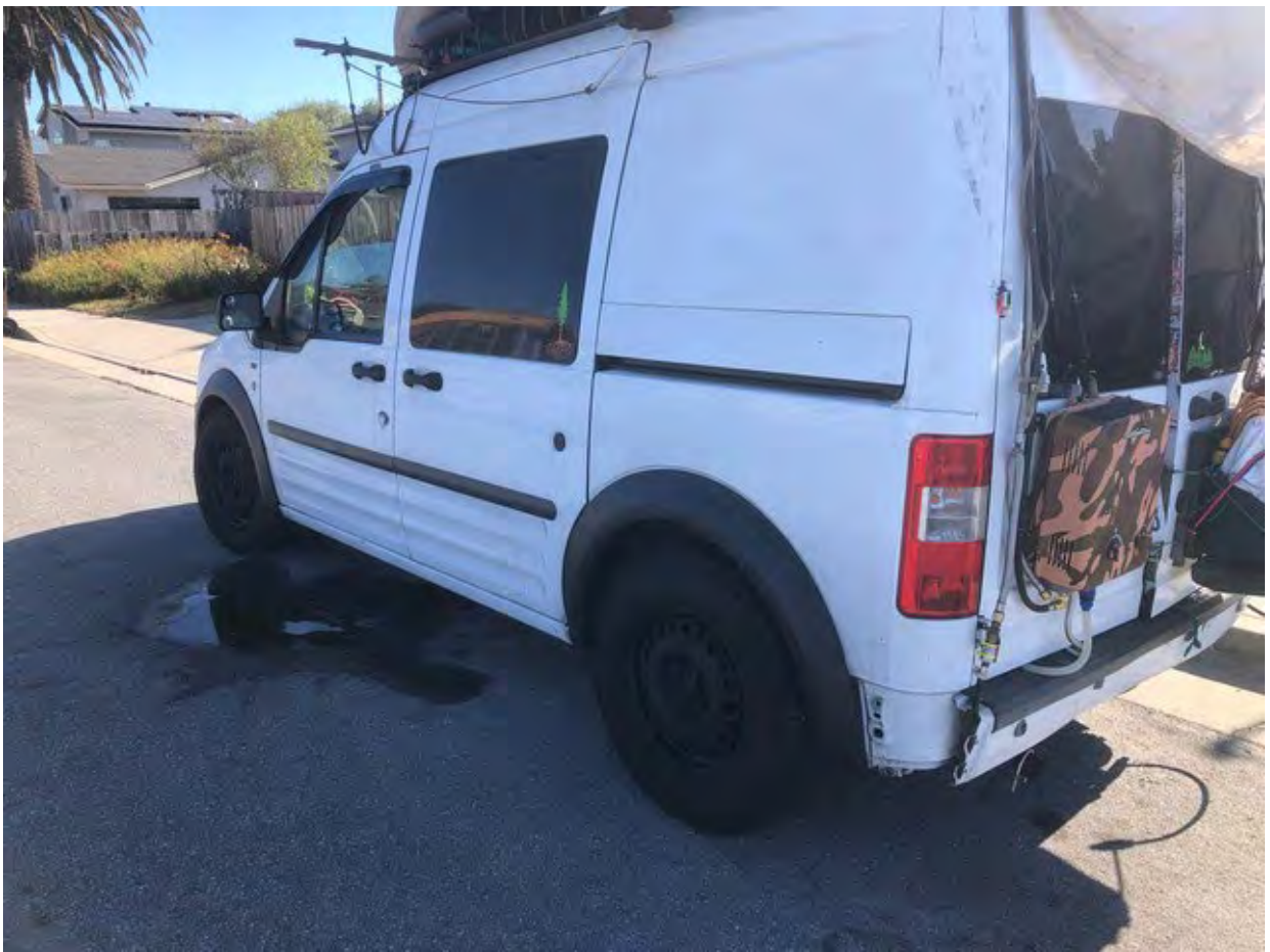
New RF parked on our street