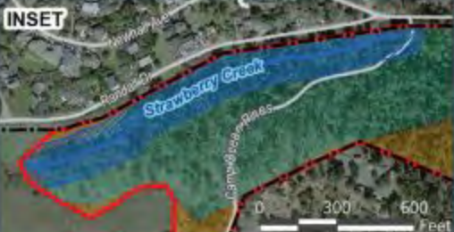
Exhibit 2 SLT-NOID-0002-23