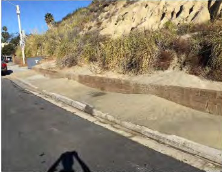
Sediment deposition after storm event (Dec. 2018)