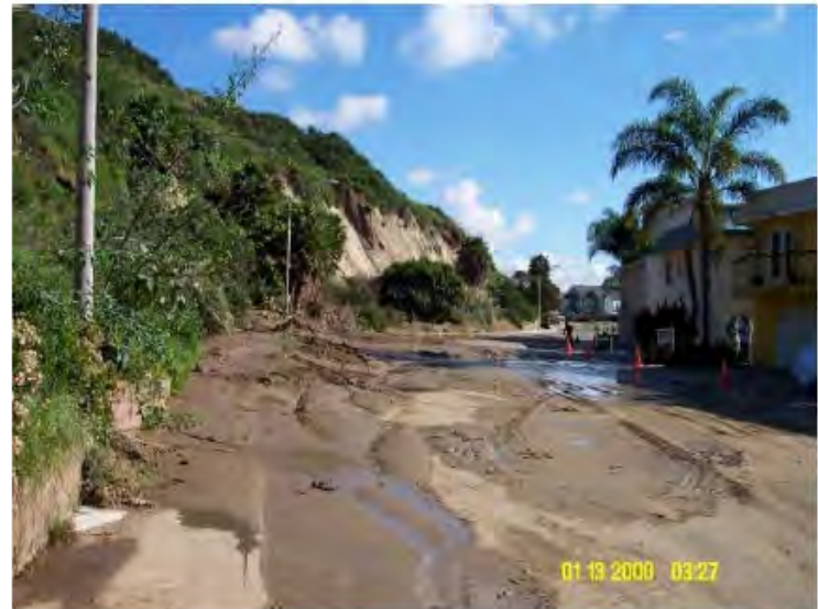
Sediment deposition after storm event (Jan. 2000)