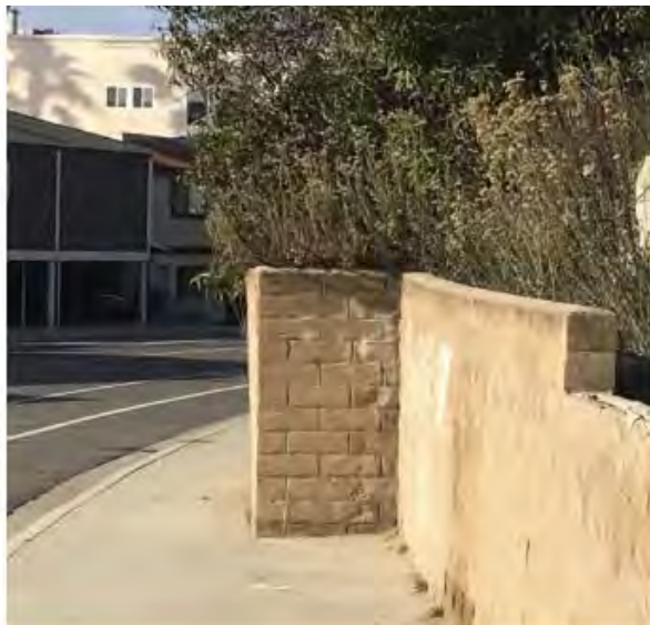
Portions of wall lean towards sidewalk