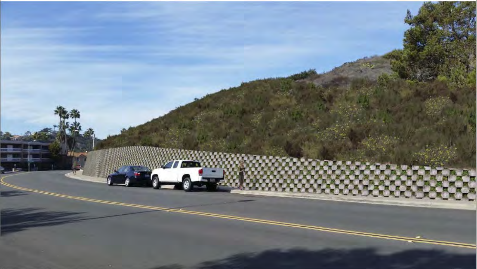
EXHIBIT NO. 3