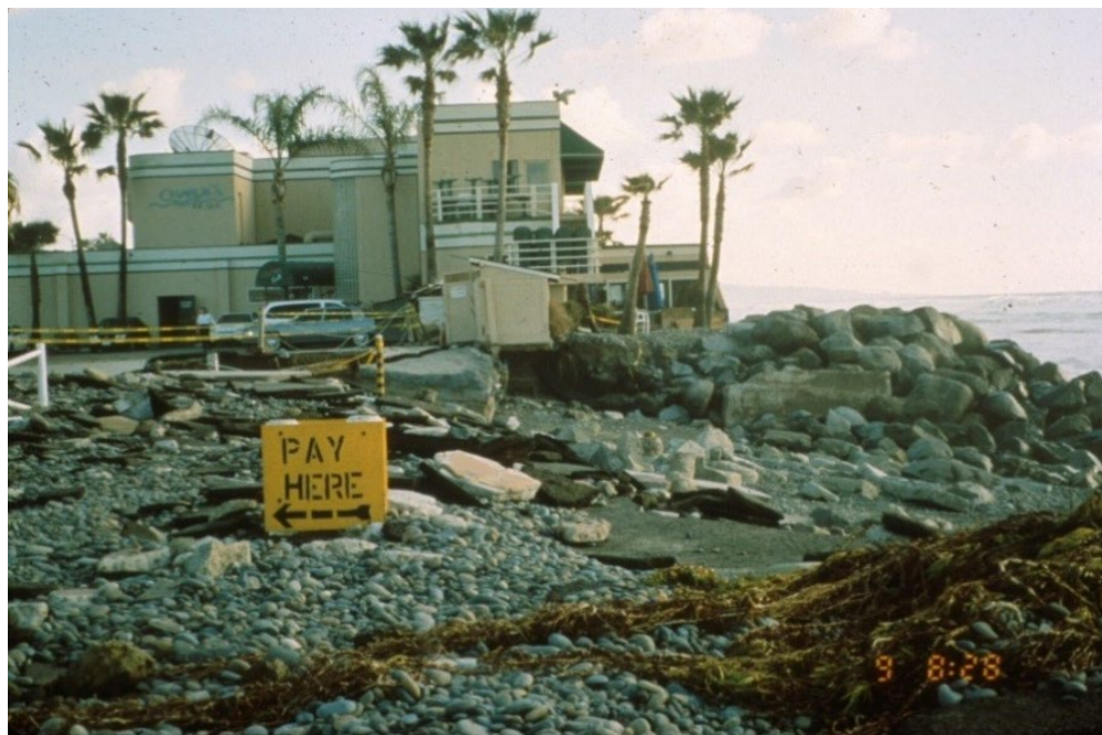
Figure 4: Cardiff State Beach, San Diego County, winter 1997-98.

The very strong 1982-83 and 1997-98 El Niños brought heavy rainfall and large waves to coastal California during multiple winter storms. There was extensive flooding, landsliding, coastal erosion, and damage to coastal structures. These storms were viewed as being extraordinary and have often been used as the "design" events for new development. The strong El Niño event of 2015-16 also resulted in extreme wave energy and shoreline retreat along California coast, but caused less damage to structures, due in part to the more northerly storm tracks and wave directions during this event. 2 On a statewide basis, rainfall during the 2015-16 El Niño was unexceptional, slightly above normal in northern California and somewhat below normal in southern California. During 1976-77, a weak El Niño, California experienced much lower than average rainfall due to a persistent high-pressure system over southern California that diverted winter storms to the north. Each El Niño is different; nonetheless, strong El Niño conditions increase the odds of wet winter weather and high waves along the coast.