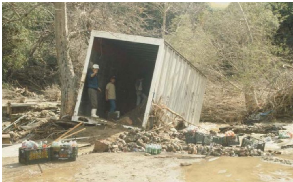
Figure 3: Topanga Creek after one of the El Niño storms of 1997-98.

sea levels and intense winter storms typical of a strong El Niño event may provide a preview of how sea level rise can increase coastal hazards. NOAA staff scientists provide in-depth information and discussion about the expected 2023-24 El Niño and related forecasting on their “ENSO Blog” at https://www.climate.gov/enso .