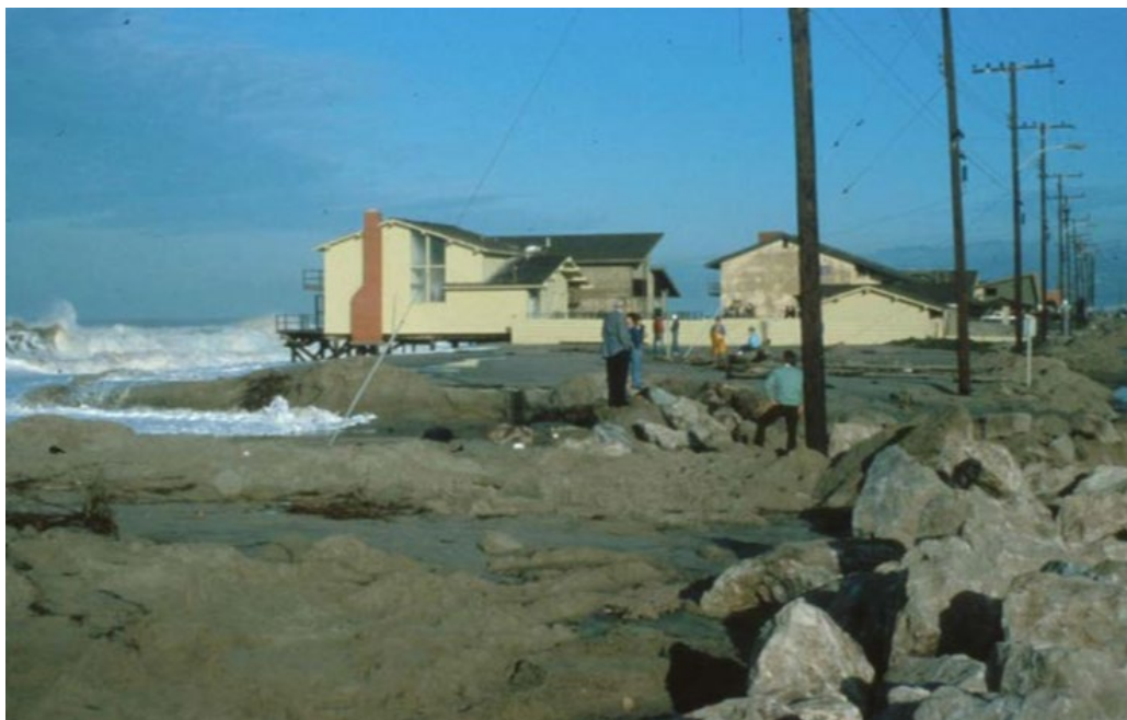
Figure 5: Oxnard Shores after 1983 El Niño storms.

Many repair and maintenance activities may require a coastal permit, especially if there will be grading, landform alteration, or the use of mechanized equipment on the beach or near a coastal stream, wetland or bluff. For projects in the coastal zone, property owners should contact both the Commission staff and local government to determine 1) if a coastal permit is necessary, and 2) what information will be needed to file an application for a permit. Many repair and maintenance activities can be reviewed quickly, and, in some cases, permits can be waived, but to avoid violations it is important to contact staff before proceeding.