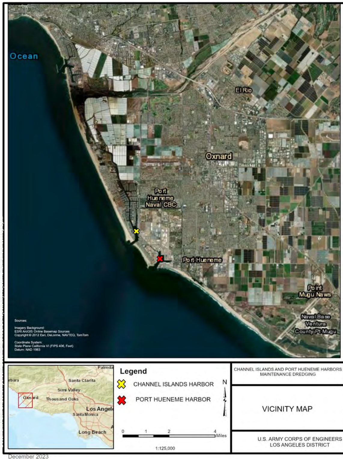
Figure 1. Regional Vicinity Map