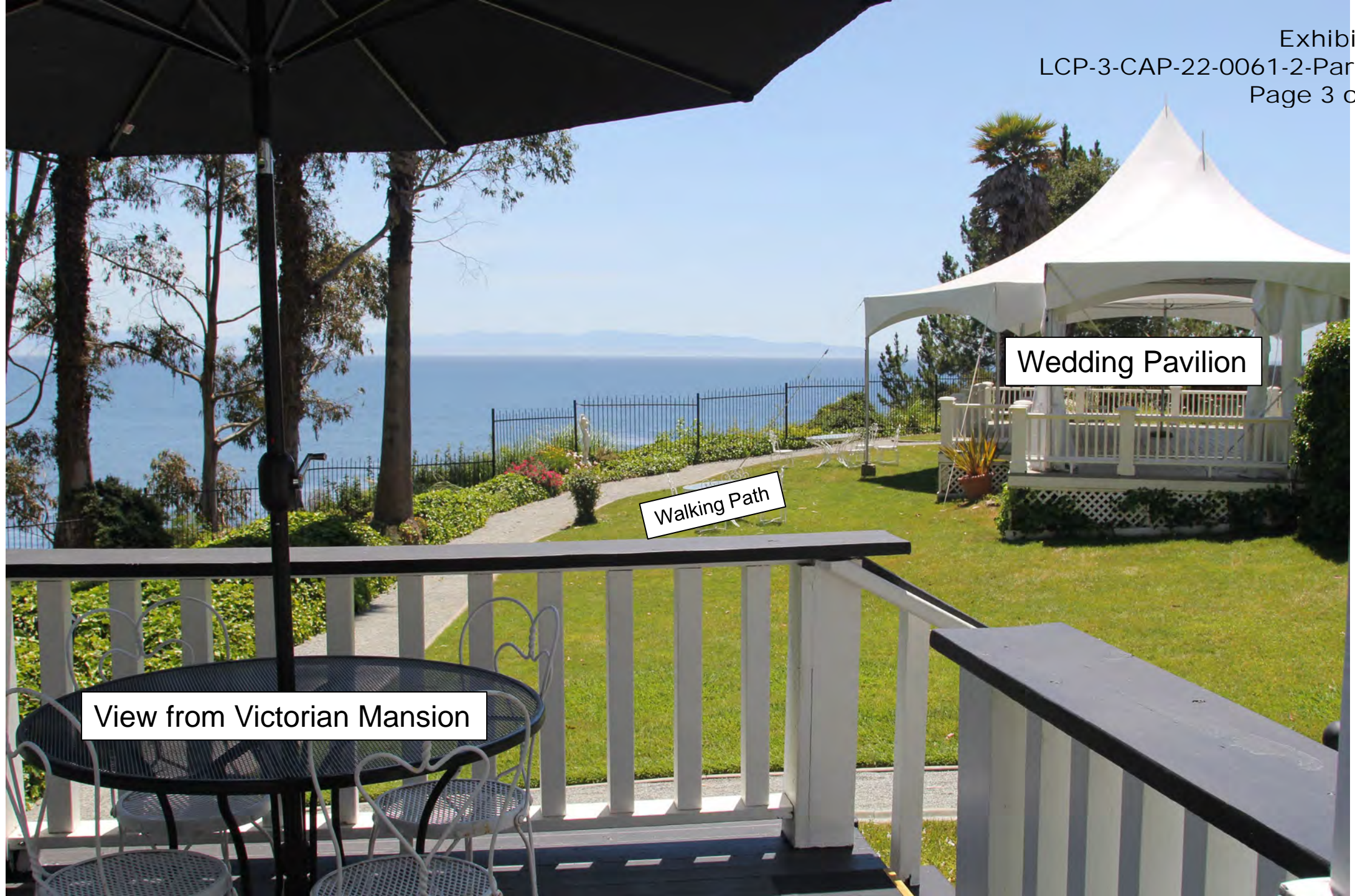
View from Victorian Mansion