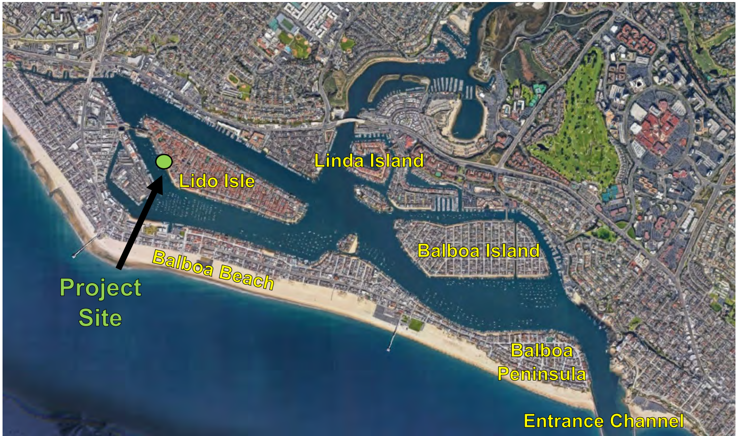
Exhibit 1—Location Map