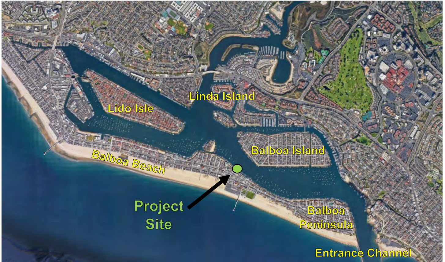
Exhibit 1—Location Map