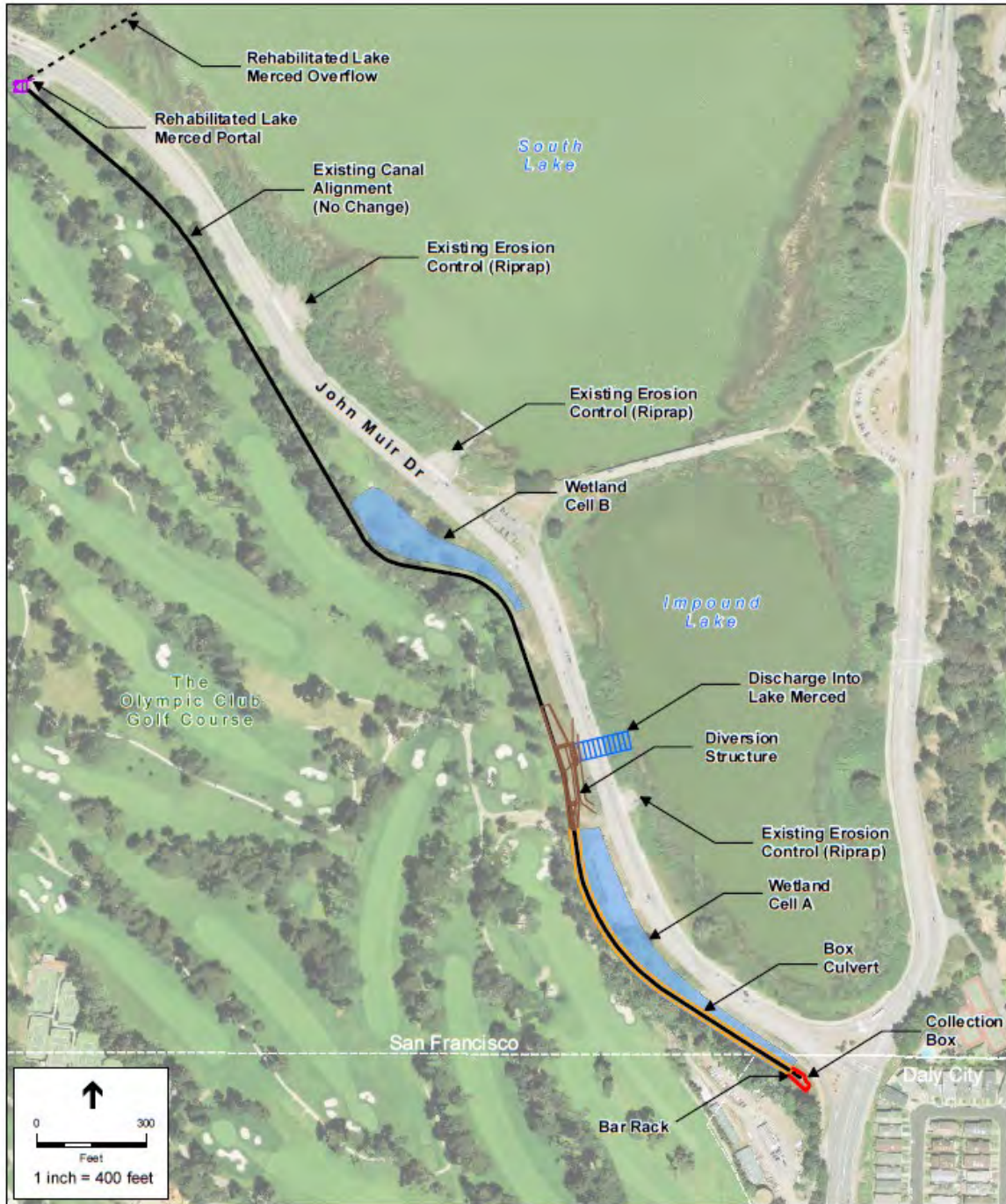
Figure 3: Canal project components.