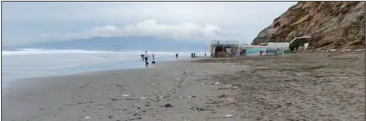
Figure 4: People recreating on Fort Funston beach near the outlet, facing north.