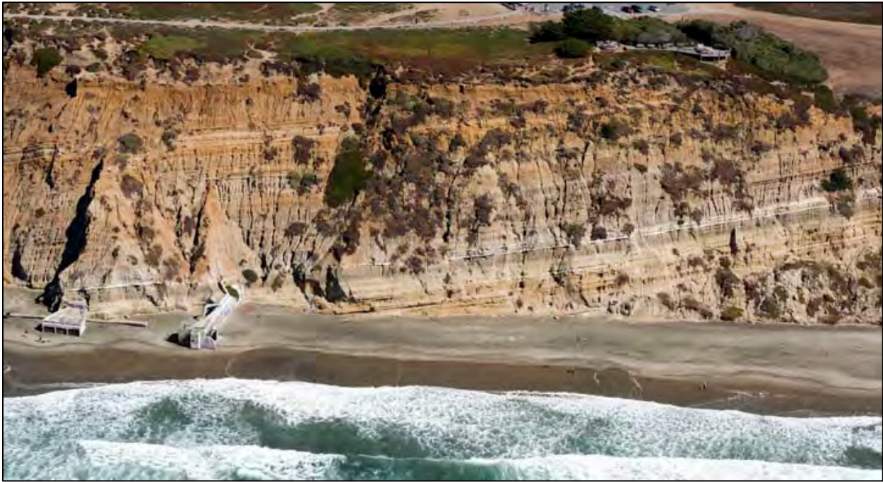
Figure 1: Coastal Records Project image from 2019, showing San Francisco's outlet to the left, and Daly City's to the right, with Fort Funston in the background.