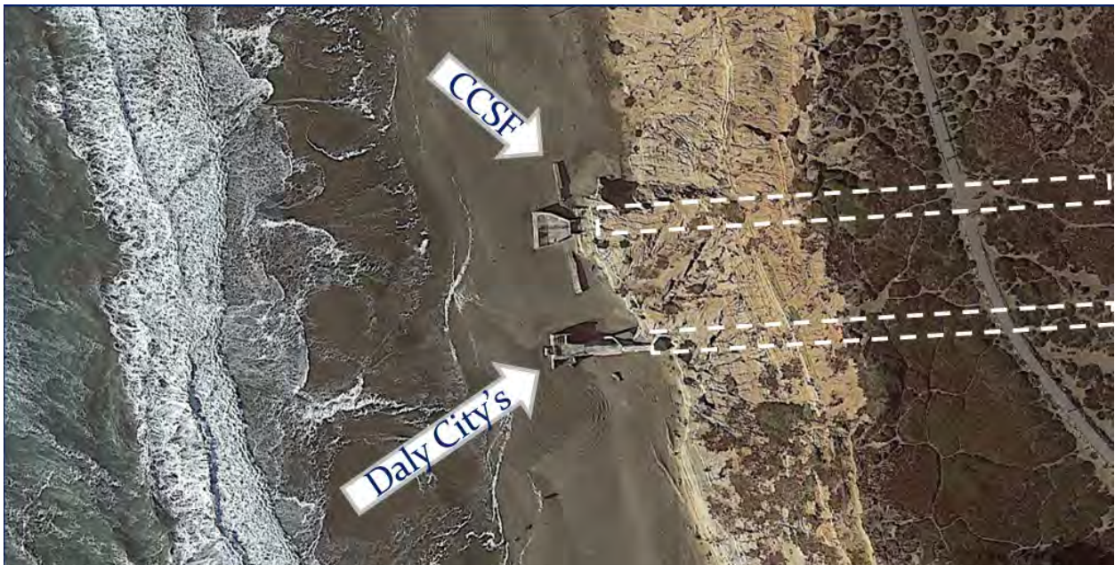
Figure 2: Aerial imagery showing the City and County of San Francisco (CCSF) outlet at the top of the image, and Daly City's at the bottom.