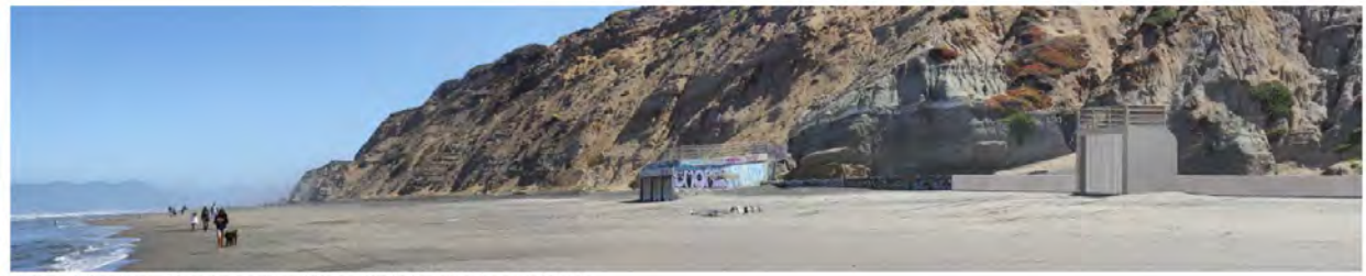
Proposed Condition – North facing view of Ocean Outlet from Fort Funston Beach