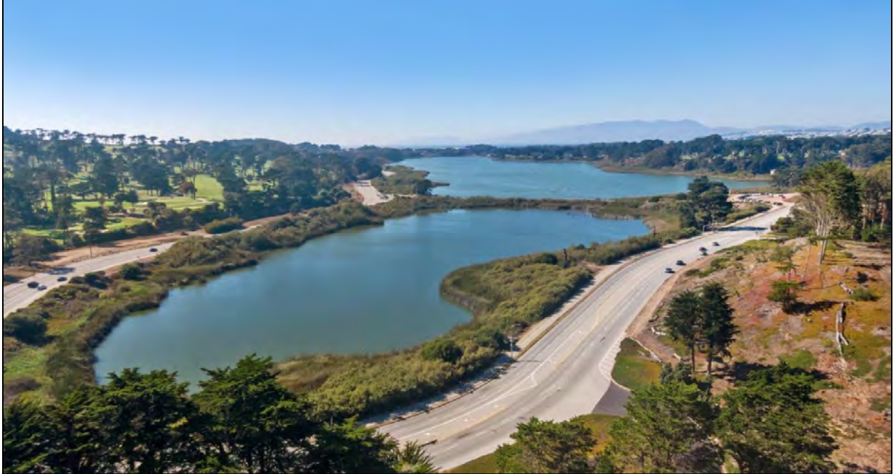
Figure 5: Lake Merced, specifically Impound Lake in the front of the image, and South Lake, in the back of the image, facing North.