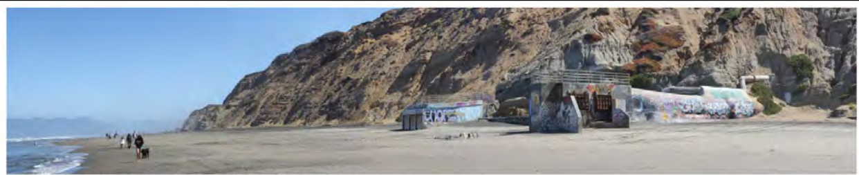
Existing Condition – North facing view of Ocean Outlet from Fort Funston Beach