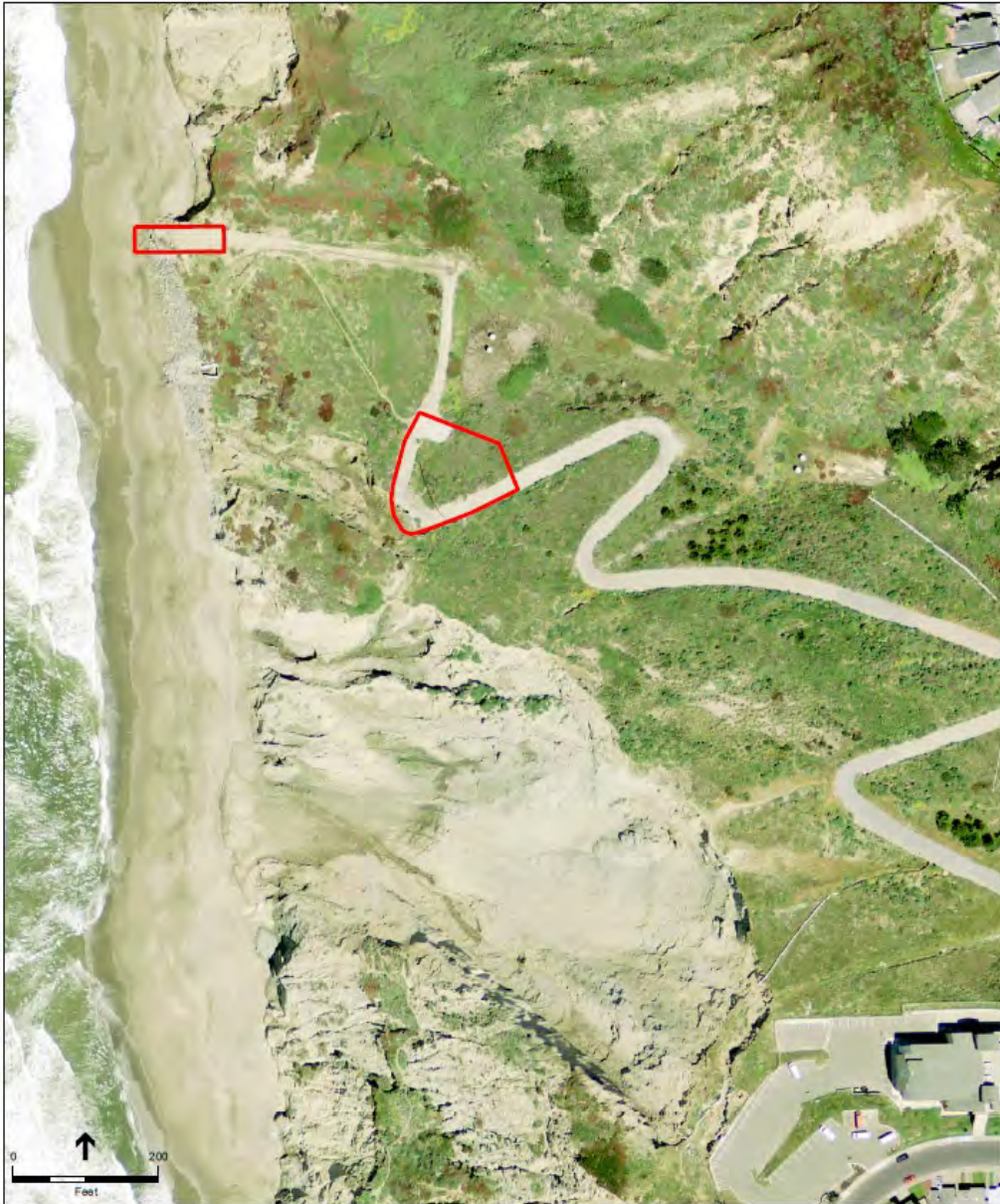
Figure 5: Avalon Canyon construction access, with the improvement areas outlined in red.