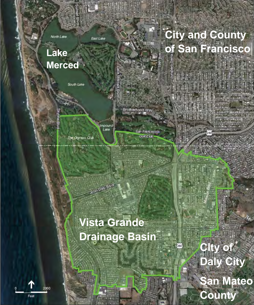
Figure 1: The Vista Grande drainage basin, in green.