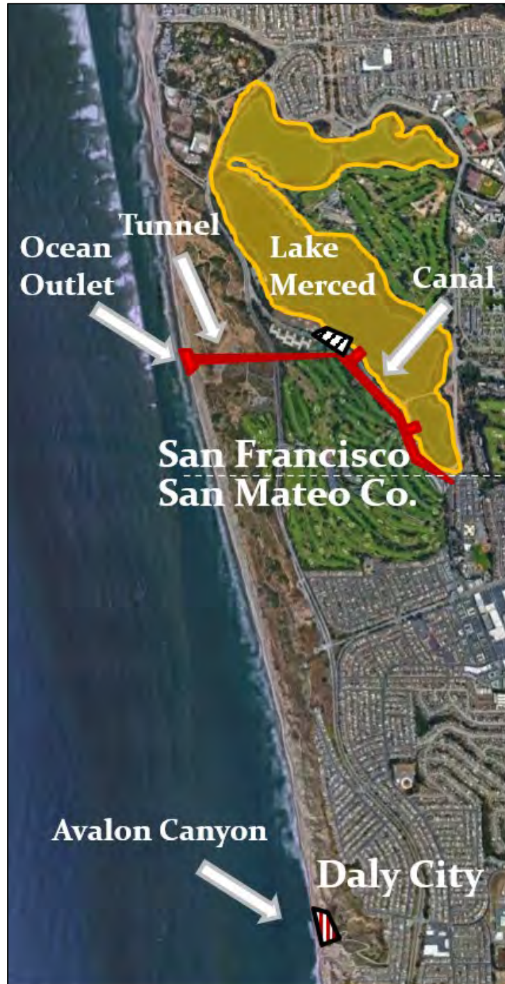
Figure 2: Project components overview.